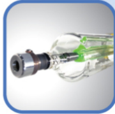
RECI Laser Tube