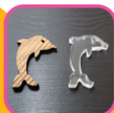
Wood and Acrylic