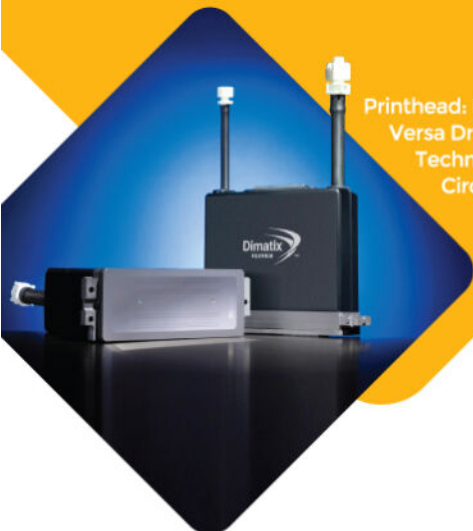
Printhead: FUJI Starfire, 10 pl, Versa Drop Gray Scale Technology, Inner Circulation.