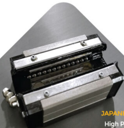
JAPANESE THK RAIL High Precision and smooth movement