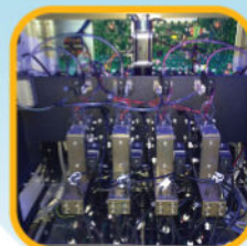
SUBTANK & PRINTHEADS