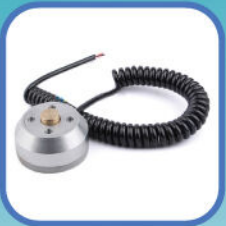
Automatic Tool Sensor