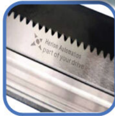
Taiwan PMI Squire Rail 25 mm