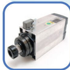
Italian HSD spindle