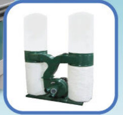
3KW Double bag dust collector