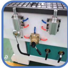
Air positioning cylinder switch