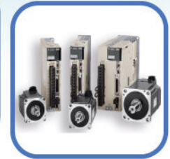
Yaskawa servo motors and drivers