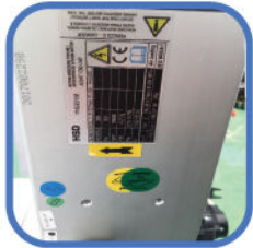
6KW Italy HDS air spindle