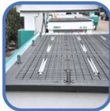
Vaccum table with T-Slot