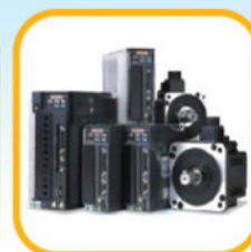
Motors and controllers: AC DELTA Servo