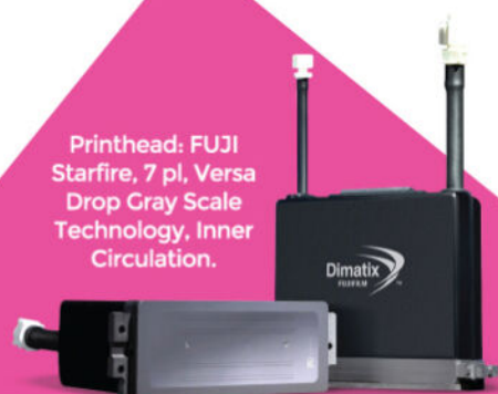
Printhead: FUJI Starfire, 7 pl, Versa Drop Gray Scale Technology, Inner Circulation.