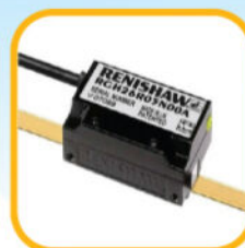
Encoder and Liner: Renishaw made in UK