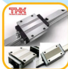
Rails: THK from Japan