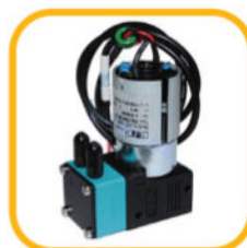
Ink Pump: KNF NF30 made Switzerland